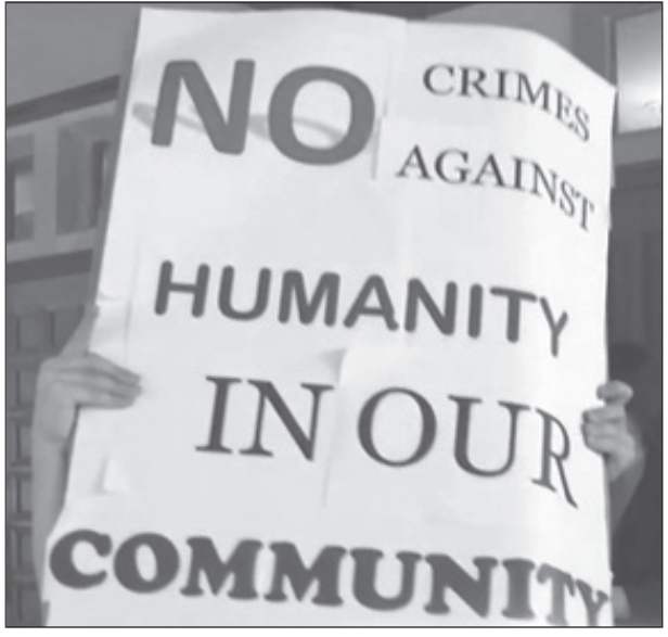
Concord residents rally to oppose detention camp

Additional operational problems include the difficulty of housing persons in restricted access bases who legally need access to immigration and civil-liberties lawyers, secure areas to discuss their cases, as well as access for advocates, relatives, news media and political activists. Another issue is the lack of state licensing requirements, such as health and building codes, which military locations enable the government to avoid.