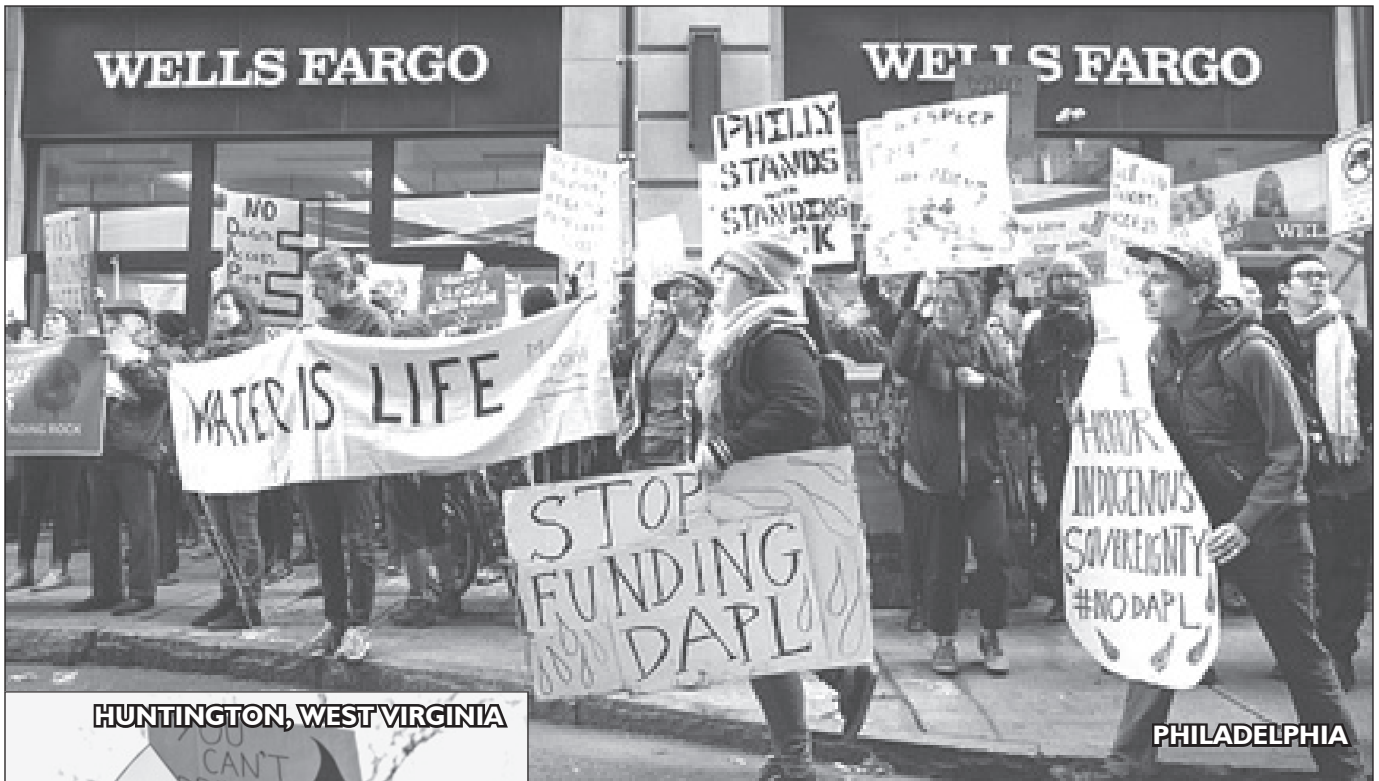
HUNTINGTON, WEST VIRGINIA