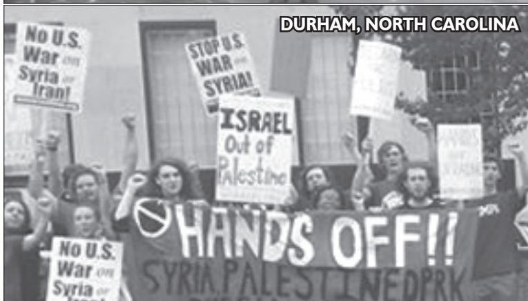
DURHAM, NORTH CAROLINA