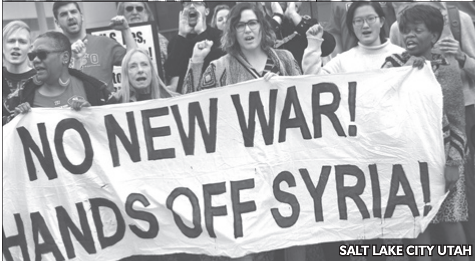
SALT LAKE CITY UTAH