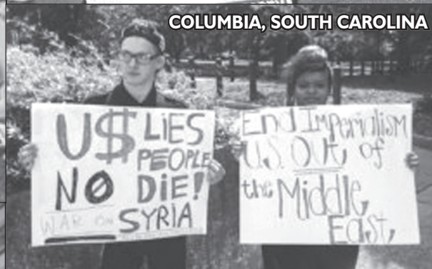
COLUMBIA, SOUTH CAROLINA